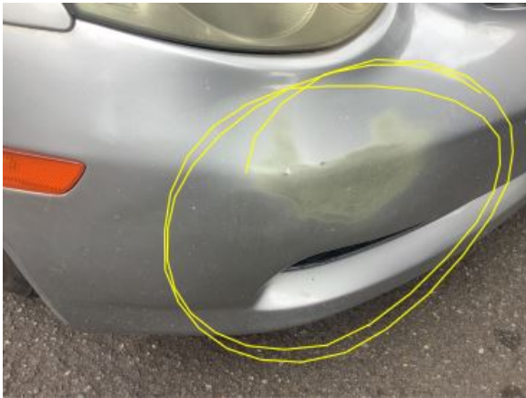
front bumper bar damages