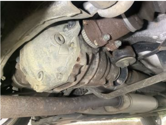
rear differential assembly