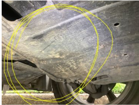
under body splash tray damages