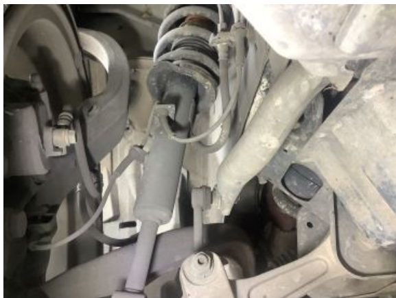
front suspension assembly