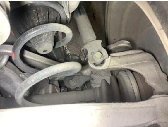
front suspension assembly