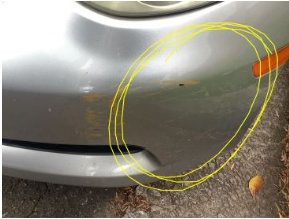
front bumper bar damages