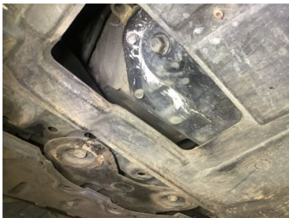
under engine bay