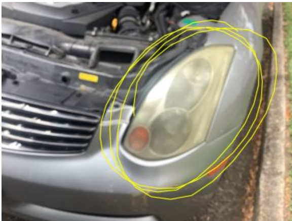
headlight lens faded