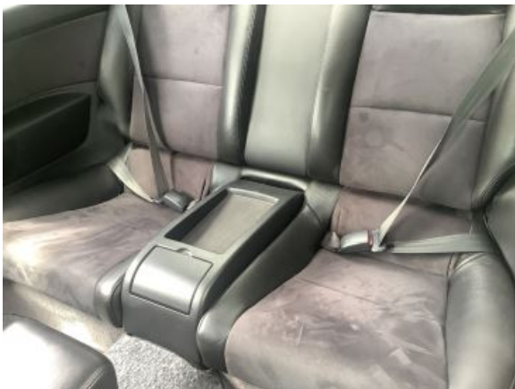
rear seats and belts