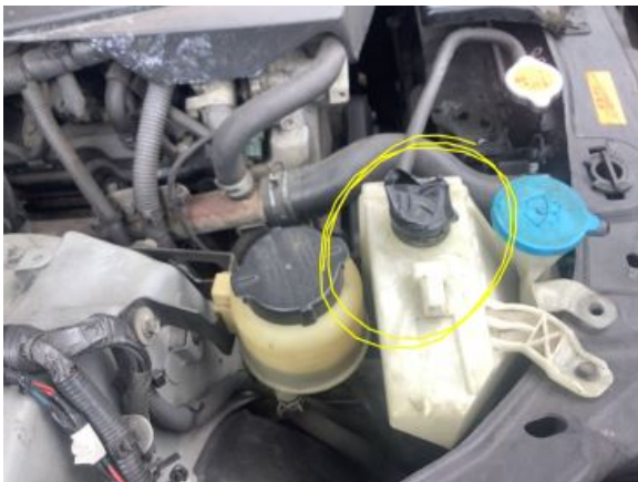
coolant reservoir cap missing