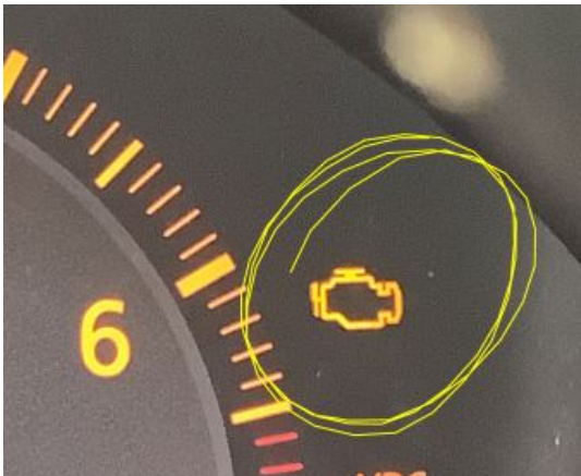
engine malfunction light on