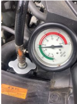
engine cooling system pressure test