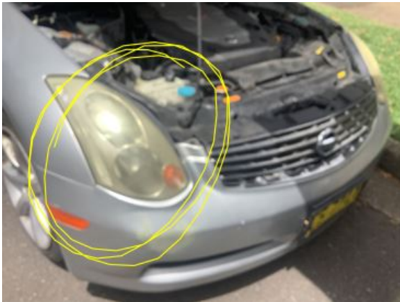
headlight lens faded