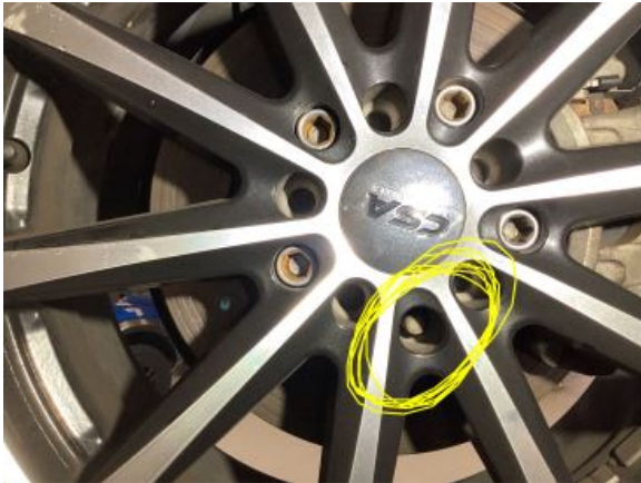
right front wheel nut missing