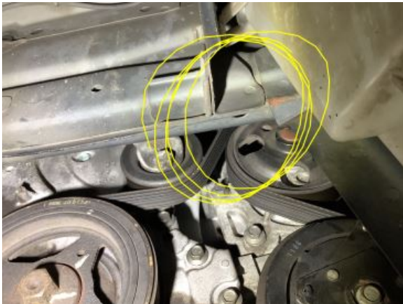
drivers side chassis bent