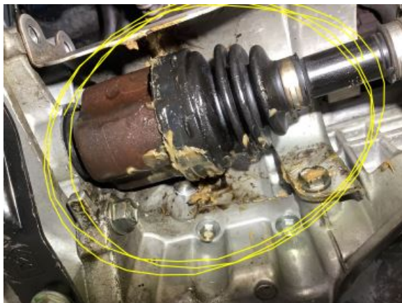
grease splashed out from Cv boot