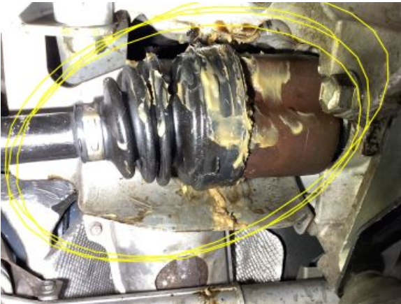
drivers side CV shaft boot leaking grease