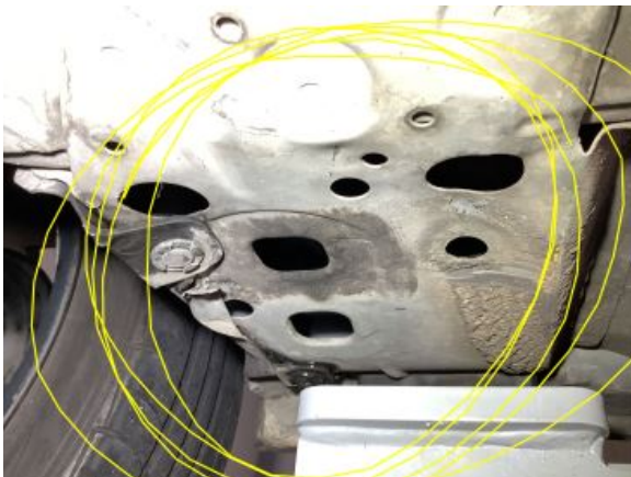
drivers side underbody support beam bent