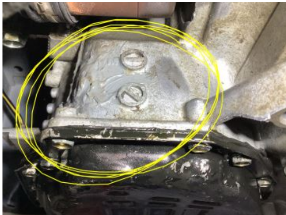
auto transmission case repaired with silicon