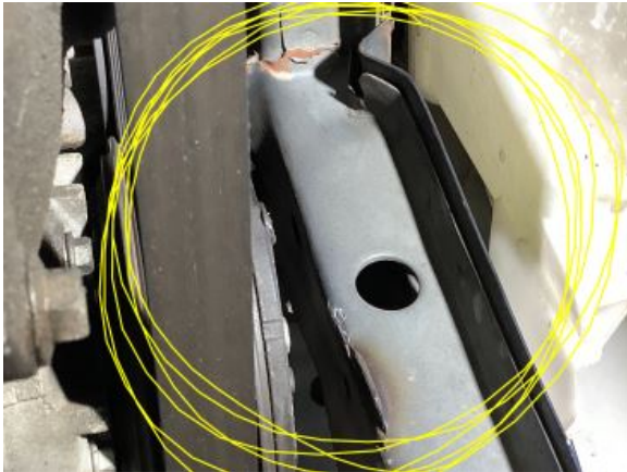
drivers side chassis bent