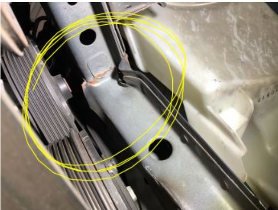
drivers side chassis bent/kinked