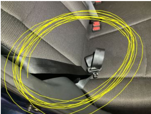
right rear seat belt does not retract