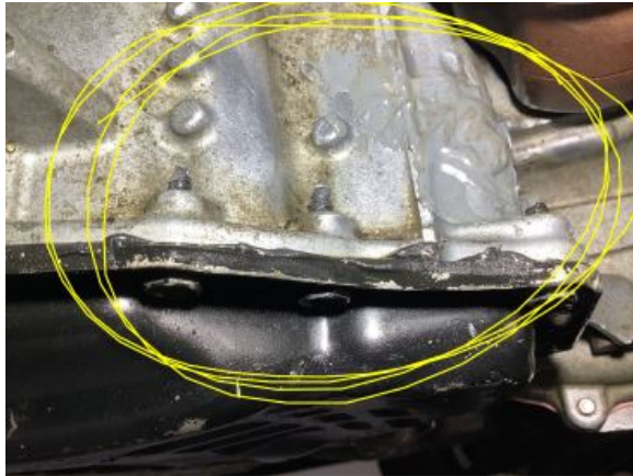
auto transmission case repaired with silicon/leaking