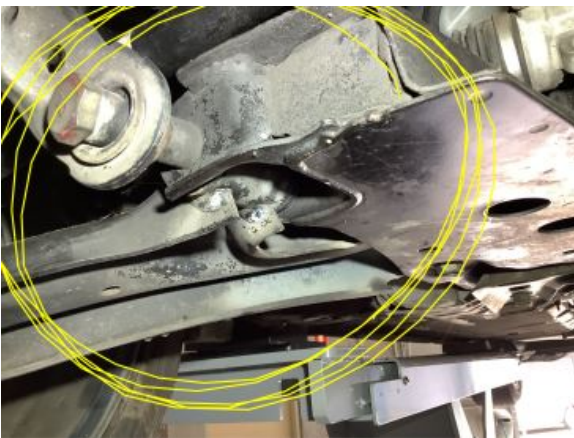
drivers side control arm bent