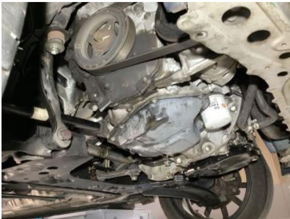
stone guards/splash tray missing underbody