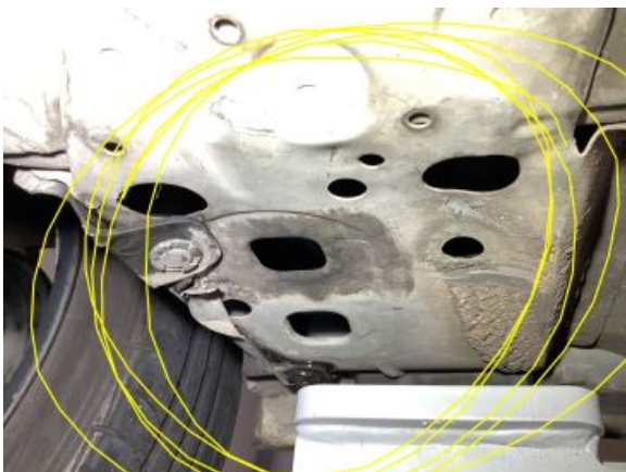
drivers side underbody support beam bent